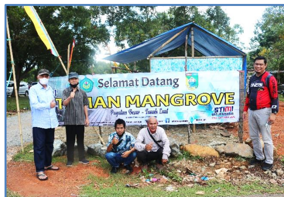
Photo : Mangrove entrance area