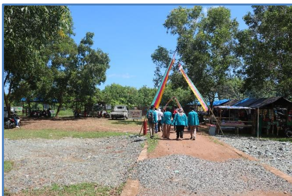
Photo : Mangrove entrance area