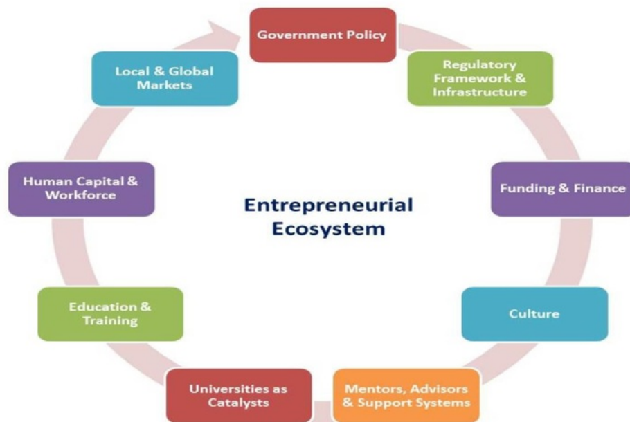
Fig.1: Entrepreneurial Ecosystem

enterprises for making economic growth of company and for this it lies on lots of stress for completing task to achieve goals. The principles of execution in the term of business management is important for achieving a goals in the social enterprises for money growth and it is also important to solve social issues in this entrepreneurship. These issues can be solve by utilization of now innovations in the product of services as well as in new economic markets.